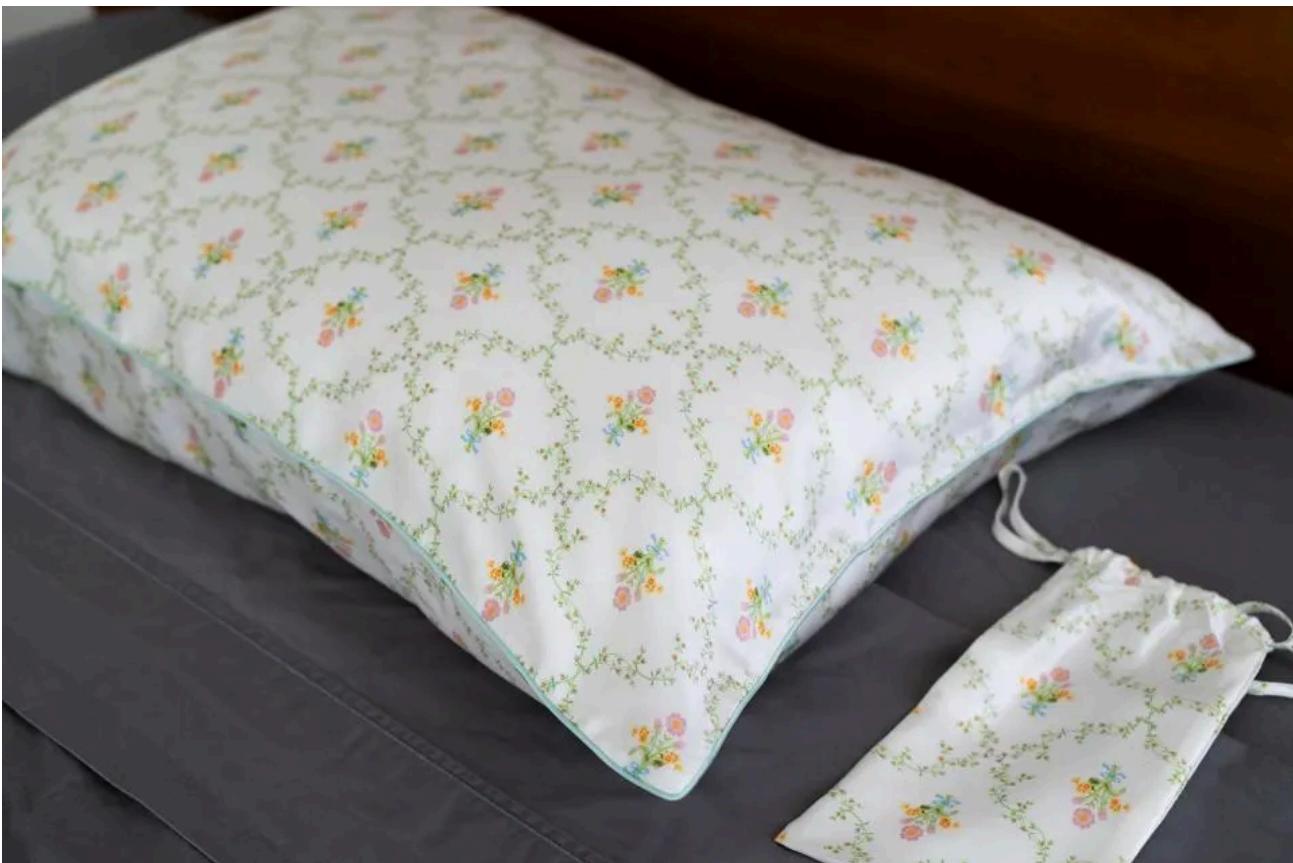
The Hill House Home silk pillowcase comes neatly packed in a matching drawstring sachet.

When Hill House Home's Sisi Silk Pillowcase arrived at my house, I was excited to open it based solely on the presentation. It was neatly packed in a drawstring sachet that matched its design. The prints, which consist of feminine, botanical patterns, mimic some of the brand's most popular styles in its cottage core-friendly clothing collection. There are five versions to choose from: four dainty floral prints and a solid white, all with piping detail and a zipper closure to keep your pillow tucked safely inside. The mulberry silk felt delicate and soft, like a vintage Hermès scarf.